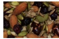
Sprouted Almonds Original Gourmet 25# Case